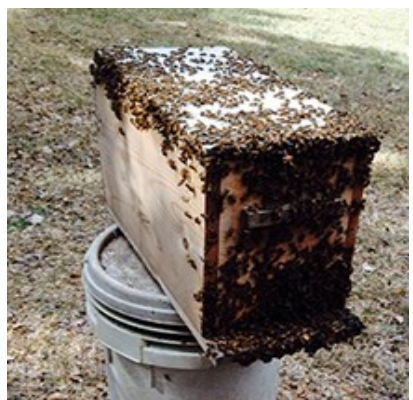
Bees ready for relocation.