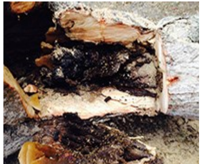
Bees and combs inside hollow tree

Grantley Samuel, one of our Farmer Vendors, removed the queen and the bees were safely relocated. The damaged, hollow tree was cut down, so that we will not have a recurring problem in that spot again.