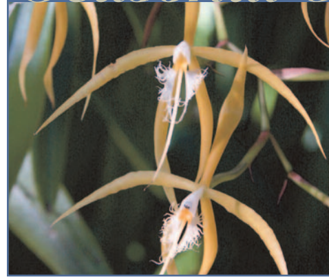
The Christmas orchid flowers in January and February.