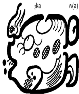
An ancient Mayan glyph for their bitter chocolate drink